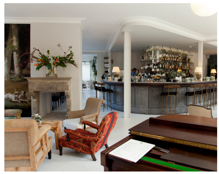
THE GARDEN ROOM